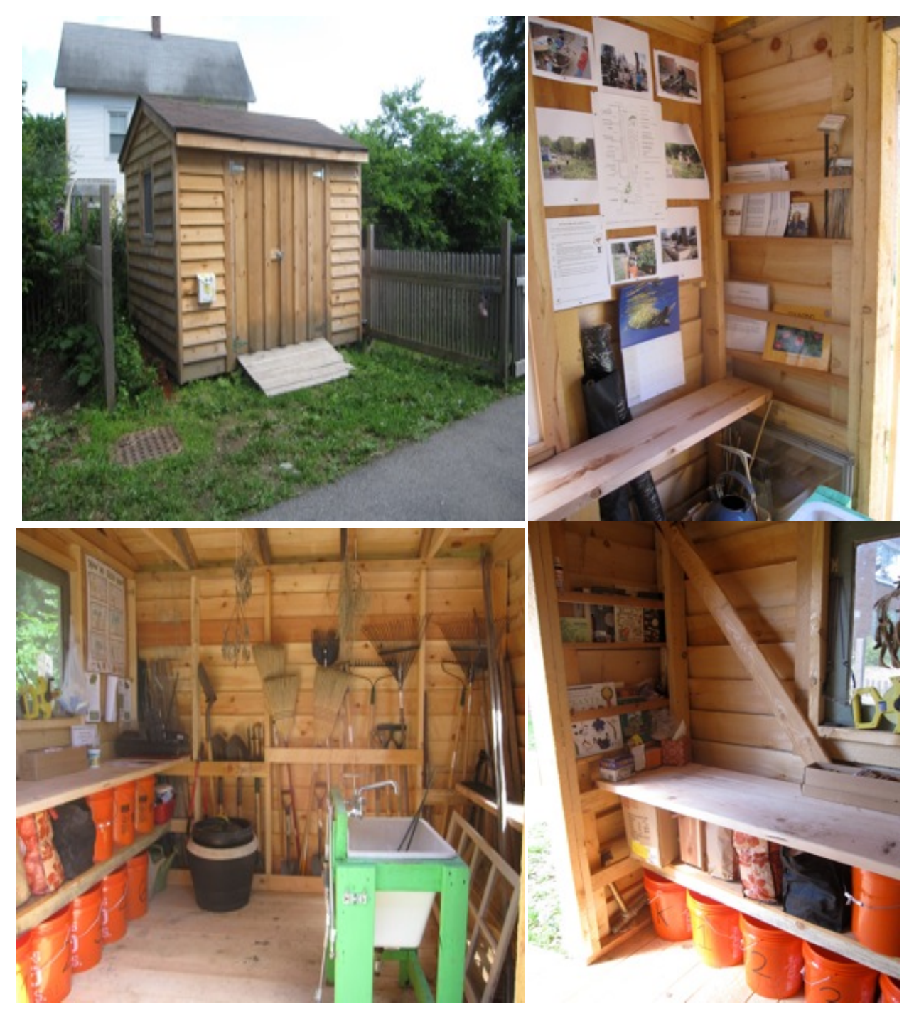
New Garden Education Shed interior pictures. Garden sink to be moved outdoors, temporarily stored in shed.