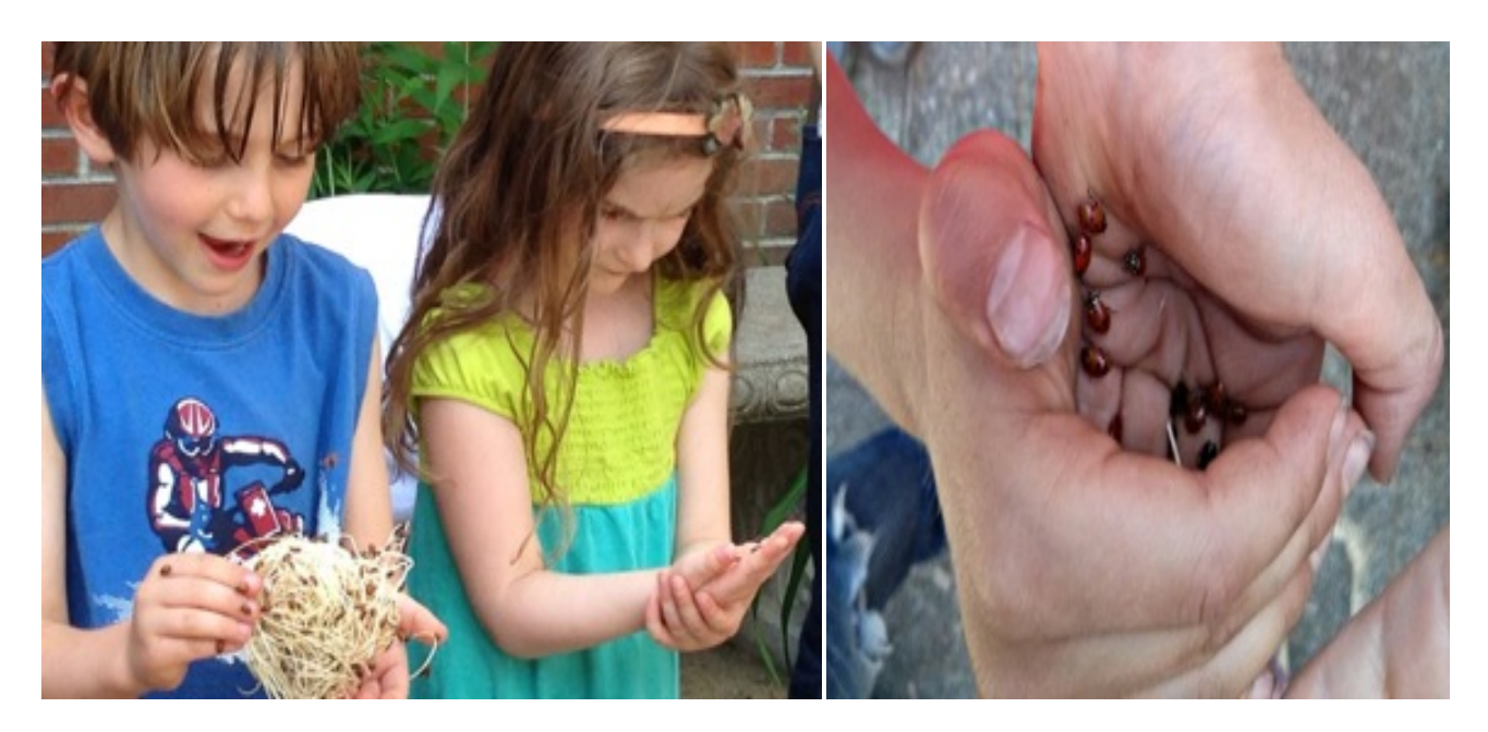
The ladybug release party was a big hit with both young and old!

Contact: <u>info@growinghaldane.com</u> Visit: <u>www.growinghaldane.com</u> fb: facebook/growinghaldane