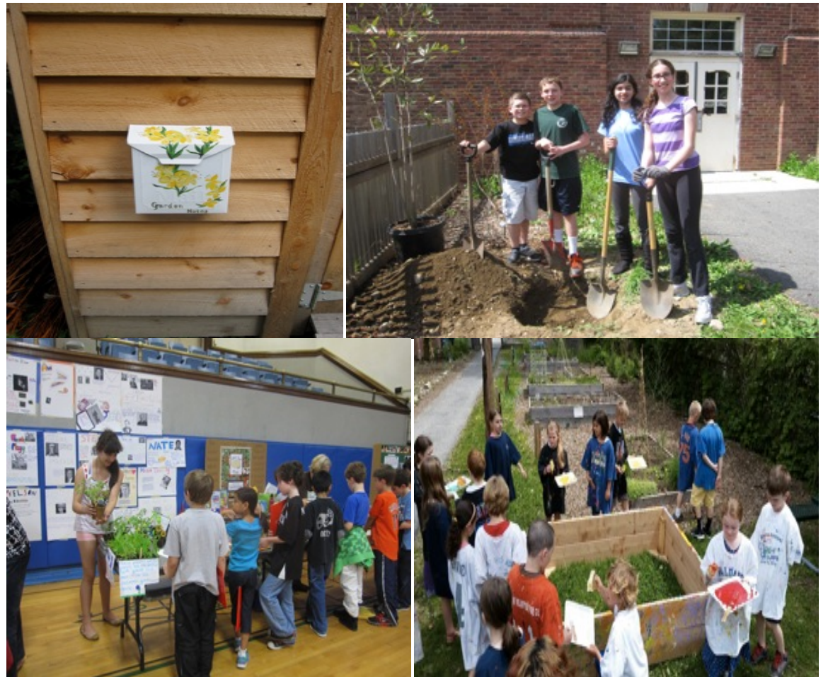
Garden mailbox, Dr. Villanti's Magnolia, 6<sup>th</sup> grade greenhouse-seedlings at Health Fair, 3<sup>rd</sup> grade painting new garden bed.

Next time you see something growing, crawling, buzzing, blooming or flying in the garden, we'd love to hear about it. Jot down your observations (and comments or questions) in the new waterproof notebook in the Ed Shed's garden mailbox ! Did you know the garden is an ideal space for celebrations? Screen Free Week kicked off their activities this spring with an after-school picnic in the garden. Class parties (for birthdays or special holidays) are also no-fuss, no-mess done outdoors in the garden!